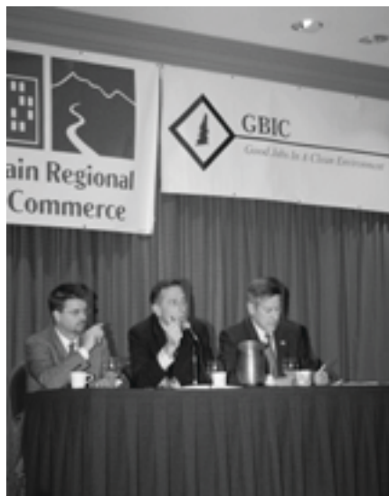
(L to R) -Lt. Governor Brian Dubie, Senate President Pro Tem Peter Shumlin and Speaker Shap Smith speak at the LCRCC/GBIC February Legislative Breakfast.

Want to know more about our political advocacy? Email dawn@vermont.org .