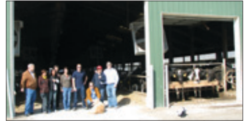
Latin American Delegation sees efficiency in action at Blue Spruce Farms' manure to methane digester in Bridport.

Throw into the mix companies such as NRG Systems and Seventh Generation that not only produce renewable energy products but also are a model of efficiency in structure and practice, and we paint an impressive green landscape all year-round.