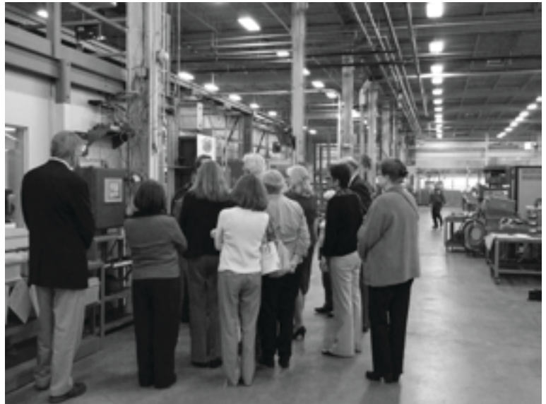
Legislative candidates tour Dynapower to learn more about the manufacturing business.