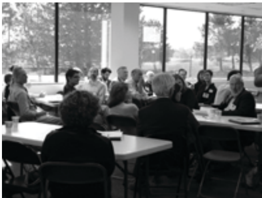
Candidates and small business owners discuss how to work collaboratively on legislative issues.

Everyone in attendance pledged to be more proactive in communicating and agreed to work together to promote a thriving economy.